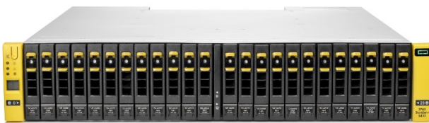
HPE 3PAR StoreServ 8000 Storage (2-Node Storage Base)

HPE 3PAR StoreServ 8000 is storage made effortless.