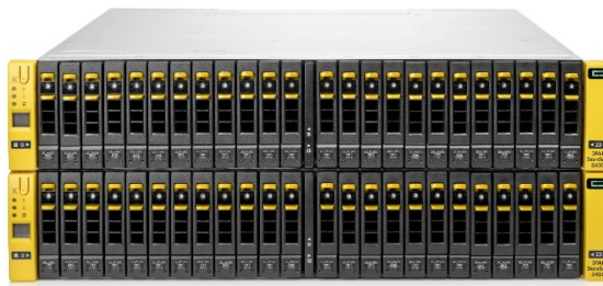
HPE 3PAR StoreServ 8000 SFF(2.5in) SAS Drive Enclosure